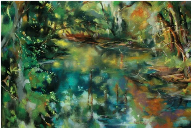
“Morning on the Pee Dee”