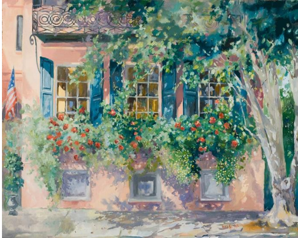
“Charleston Window Boxes”

a new member to our guild. Below are some examples of her work.