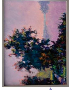
Honorable Mention "Crossing to Hog Island" Oil / Cold Wax Mary Bell Steffen