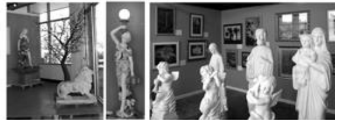
Carved Stone Sculpture & Fountains Cast Bronze Lighted Trees

Waccamaw Art Center 2999 Waccamaw Blvd. Myrtle Beach, SC 29579 Mon-Sat 12-6 Sun 10-2 (843) 236-4692