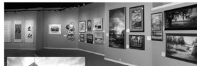
Located in the Fantasy Harbor Area at 501 and the Waterway

Free Art Print to the First 100 Visitors